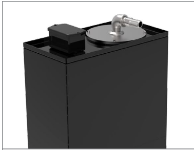
25 GALLON RESERVOIR • With built-in, 10-micron filter