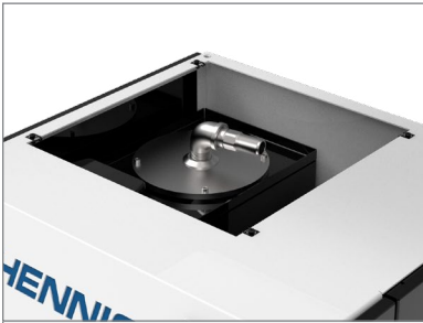
EASY ACCESS FILTER • 10-micron bag filter