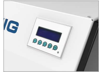
CONTROL INTERFACE • Set pressure & view filter life