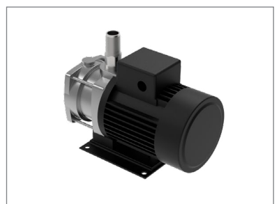
BUILT-IN TRANSFER PUMP • No external pump or wiring