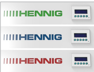
STATUS LIGHT • On (green) • Idle (blue) • Warning (red)