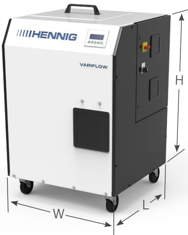
L: 25.5" (647.7 mm) W: 26.5" (673.1 mm) H: 37.5" (952.5 mm)